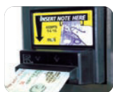
MDB protocol ready