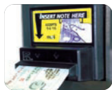
MDB protocol ready